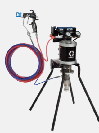
30:1 air-assist stand mount