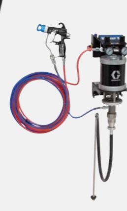
30:1 air-assist wall mount