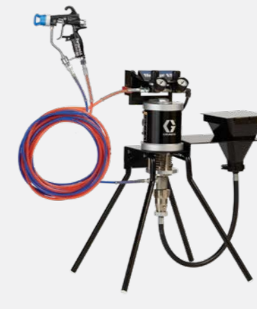
30:1 air-assist stand mount with hopper